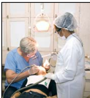
Treating a patient.