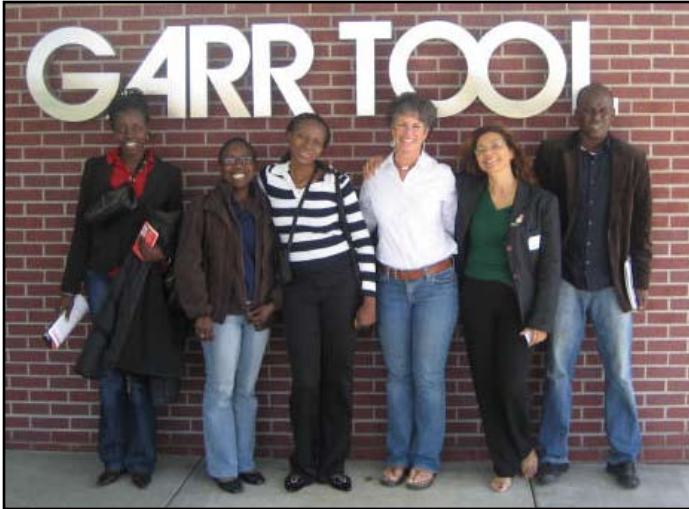
The team visited Garr Tool in Alma.